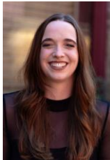
TZYLYE STEINMAN MEZZO-SOPRANO